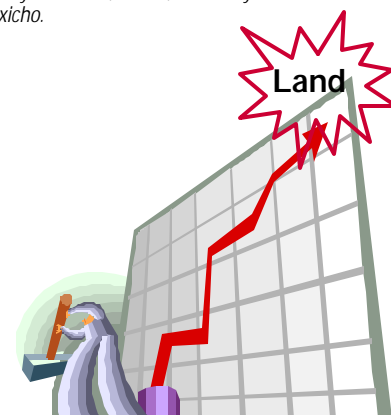
Matamoros land fund goal of $18,000 met..

Thank you again for your prayers and generosity to help make the land acquisition possible.