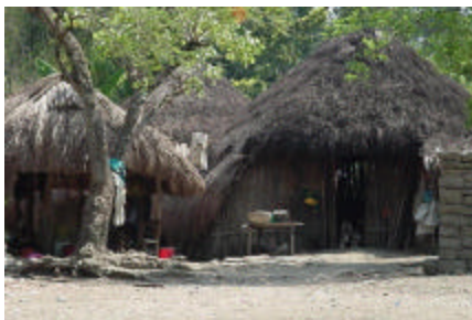
A typical home of an Aztec family in Taxicho.