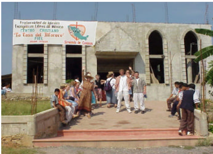
Smyser Christian Church members celebrate the cement floor being poured in El Alfarero Church in San Felipe, Hidalgo, Mexico.

Thanks be to God the Fall Aztec Medical Clinic in Citlala, Hidalgo was a great success. As you know, the Clinic had to be moved from its original site of Hueyapa. We continue to pray that God will open the door to this village. There are believers there who fear persecution. They have witnessed first-hand the burning of houses and crops and expelling of others who have become Christians. Please continue to pray for them. Two weeks before we were scheduled to have the clinic in Hueyapa, Bread of Life Frontier Missions, Grace Air Ministries, Harvest Field Ministries and the Lions Club teamed up to work in the Aztec village of Citlala.